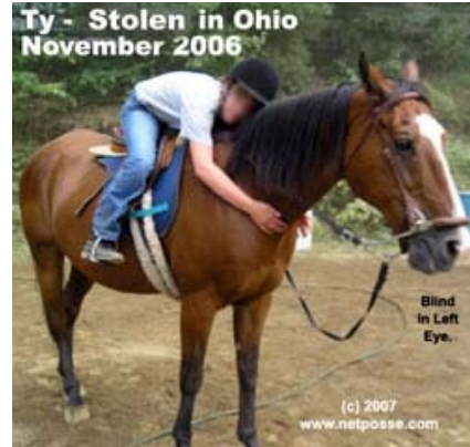
Ty, a half-blind quarter horse gelding, has not been returned after been leased out from a kids' camp in Ohio.

http://www.netposse.com/stolenmissingimg/stolenKodaAlbertaCan4-03.htm