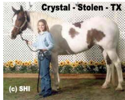
This young girl's paint mare was stolen from her trainer's stall in Texas .

Read comments or post your own comments to this article at the bottom of this page.