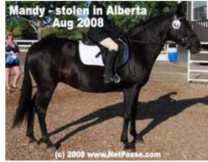
This beautiful black show pony mare was stolen from her home in Alberta , Canada , in August.

Mandy is missed by more than just her 9-year-old rider, who has enjoyed showing her through the Pony Club and for riding lessons. This gentle soul has taught a number of children to ride and won many a ribbon. But now the beautiful black show pony the young lady and her peers adore has been stolen.