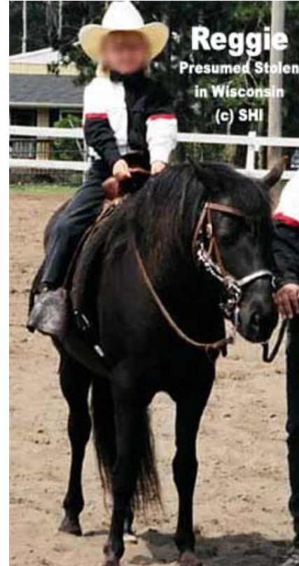
Reggie is another black Welsh-cross pony presumed stolen in Wisconsin, May 26, 2004, still missing.

Joey Fat Boy, Bay Quarter Horse, Stolen in Montana: http://www.netposse.com/stolenmissing/stolenmissingimg/