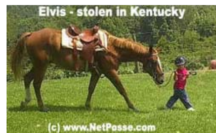
Elvis was stolen from a child in Kentucky who remains heartbroken and confused over his theft.