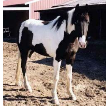
Judy was one of two mares stolen during a wagon train. They were recovered off an old logging trail while thieves apparently left to retrieve a trailer.