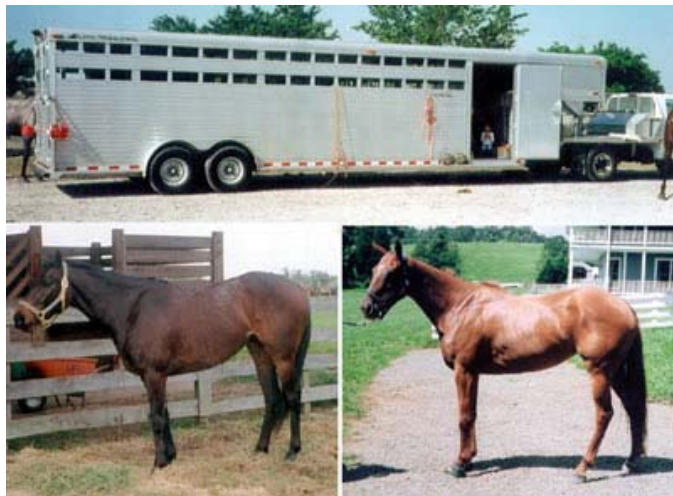
Brazen thieves not only stole these two polo ponies in Wellington, Florida, from event grounds, they hauled them away in the owner's truck and trailer.