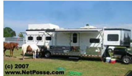
Horses left tied to a trailer for even 30 minutes could become the targets for theft. This happened to Seven in Montgomery County, Texas.