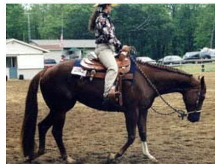
When Tahoe was taken from her stall during an event, the battle to recover her took its toll not only on her family, but on the horse as well.