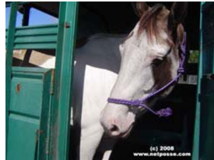
Pinta was loaded up and taken from her stall during a roping competition. While event personnel verify horses in the trailers arriving at an event, no one bothers to check a trailer that is leaving.