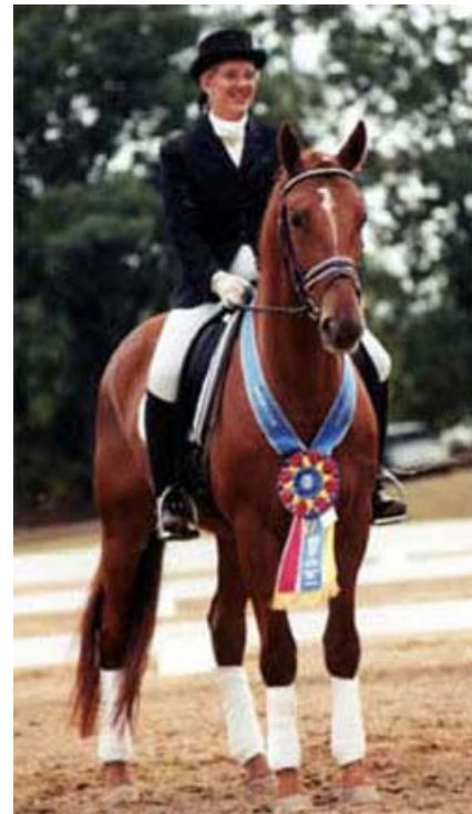
Showing and eventing aren't just about the ribbons and trophy saddles. Can you imagine going home with an empty trailer?

Read comments or post your own comments to this article at the bottom of this page.